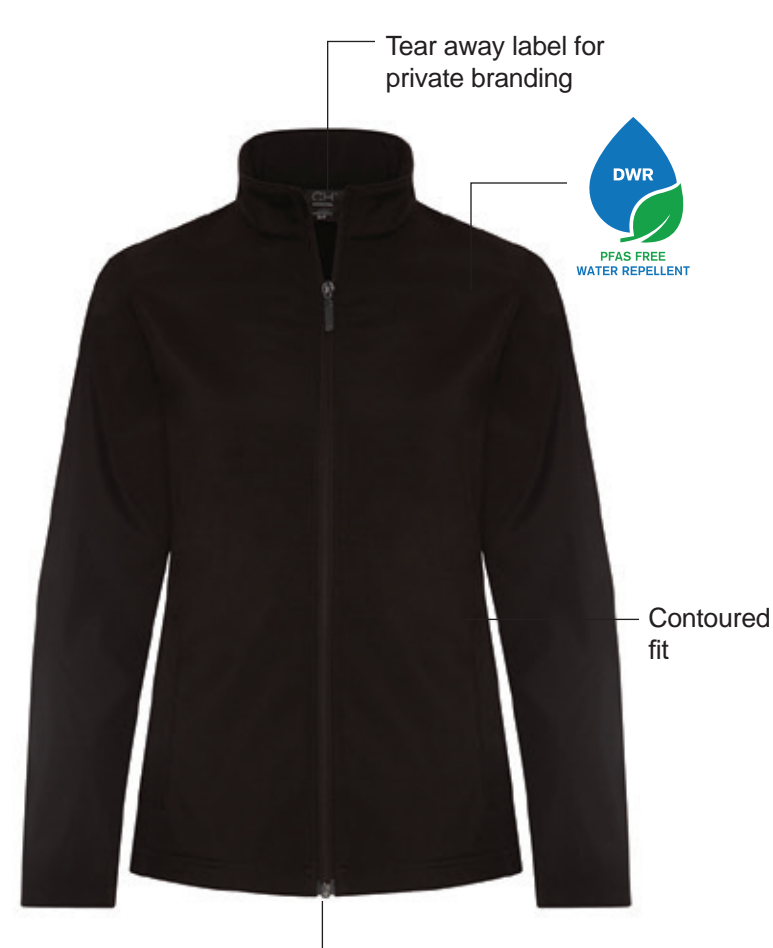
Reverse coil zipper at centre front and hand pockets