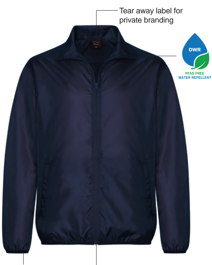
Spandex binding on cuffs and hem